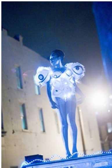
IMAGE CREDITS: top to bottom: Wearable Art model, InLight Richmond 2009; Wearable Art model, InLight Richmond 2008